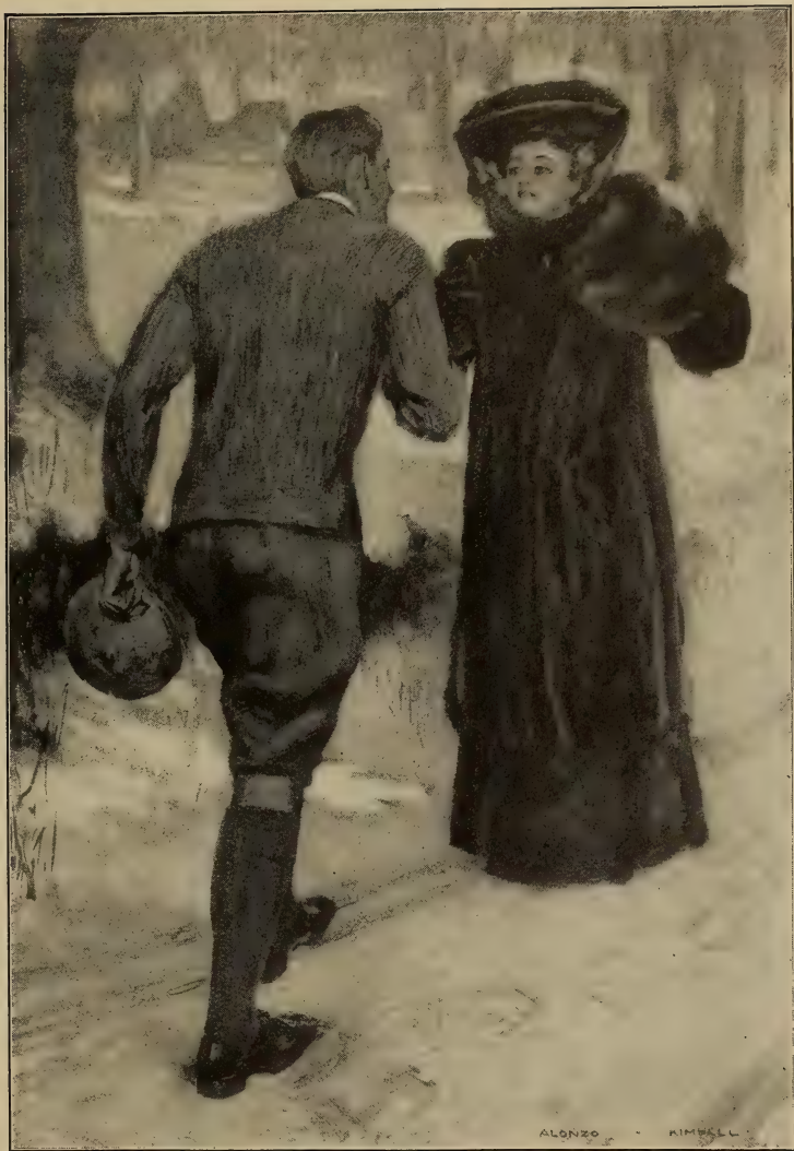
Half-way up the slope to the house they met.